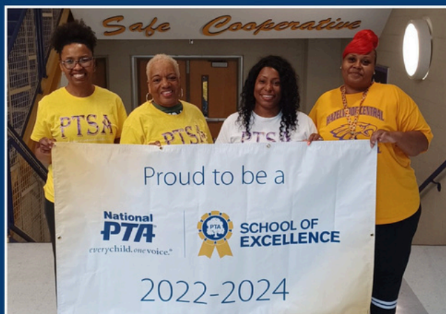
HAZELWOOD CENTRAL MIDDLE SCHOOL PTSA