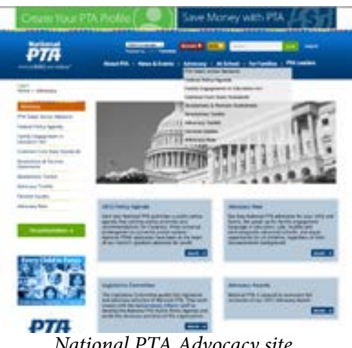
National PTA Advocacy site