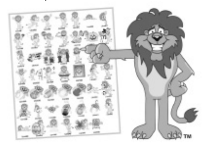
See if we have a clipart set of your mascot already done at www.toons4biz.com.

Each mascot comes in its own clipart set featuring the mascot doing a variety of elementary school related activities.