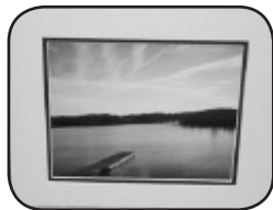
Intermediate Photography Winner Ian Cross, 5 th grade Ridgeview Elementary PTA Liberty/Pony Express Region