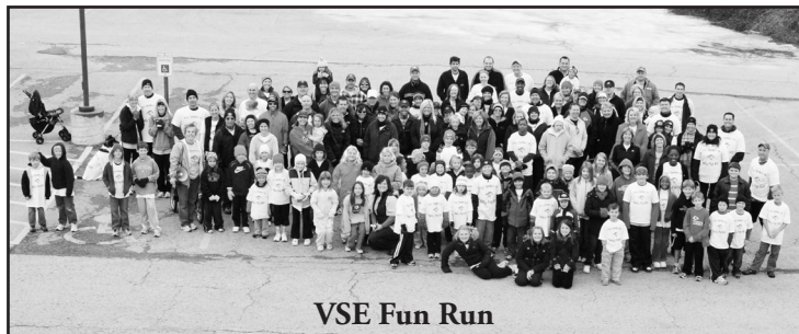
VSE Fun Run

Two years later, the dream was a reality! The track was opened with a ribbon cutting and Family Fun Run. This was truly a group effort involving students, parents, teachers/staff, school district personnel, and the community — and all we had to do was ask! Don't be afraid to chase your Unit's dreams!