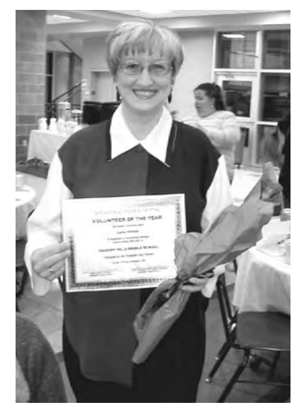
One of the many Volunteers of the Year recognized at the SCPTA Founders Day event

This year's Springfield Council of PTA's event was titled "A Feast for the Eyes!"