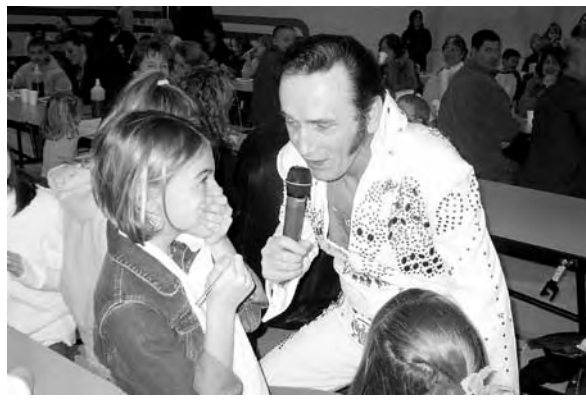
"Elvis" entertains attendees of the Blue Springs Founders Day.

PTA's 110th birthday was celebrated throughout the nation in February. Units and councils here in Missouri celebrated in a variety of ways. For example, the Nixa