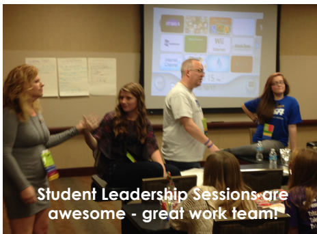
Student Leadership Sessions are awesome - great work team!