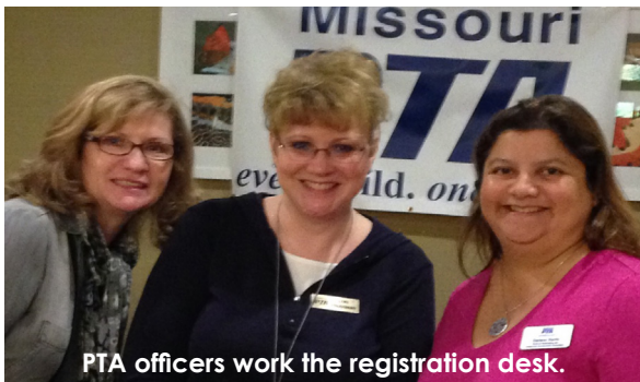
PTA officers work the registration desk.