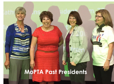
MoPTA Past Presidents