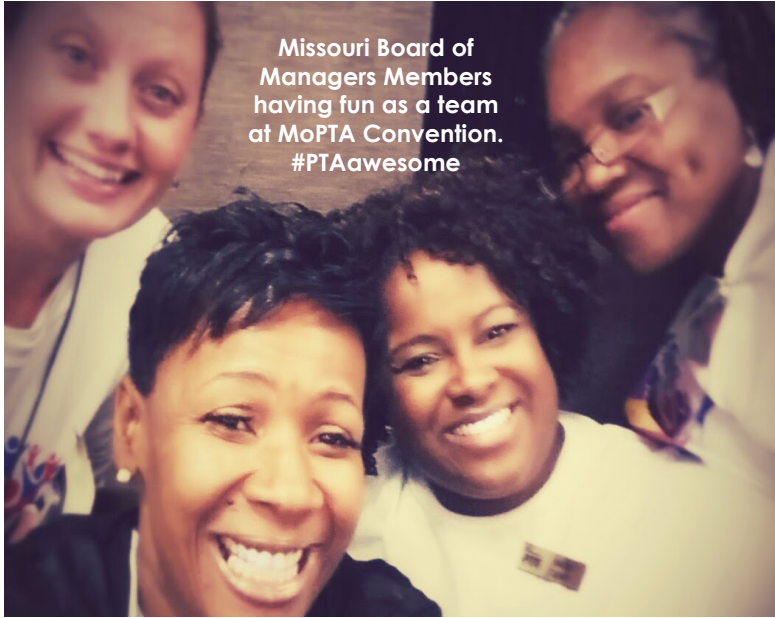
Missouri Board of Managers Members having fun as a team at MoPTA Convention. #PTAawesome