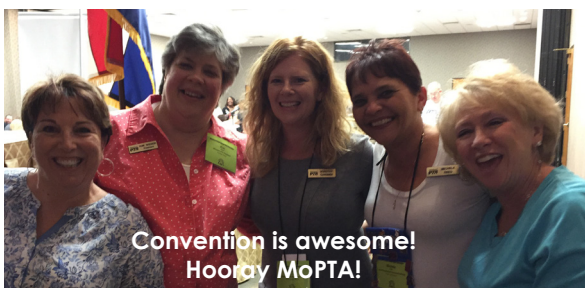
Convention is awesome! Hooray MoPTA!