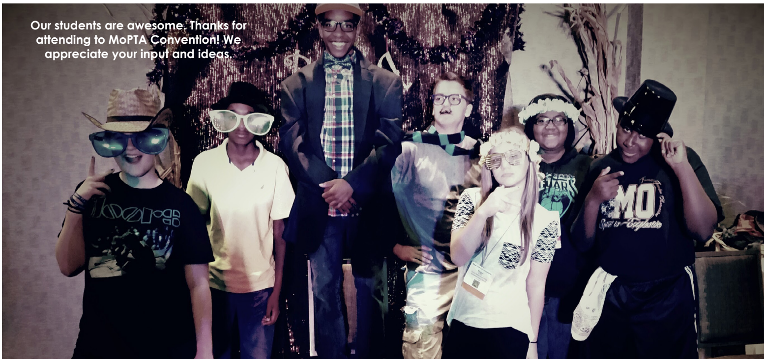
Our students are awesome. Thanks for attending to MoPTA Convention! We appreciate your input and ideas.